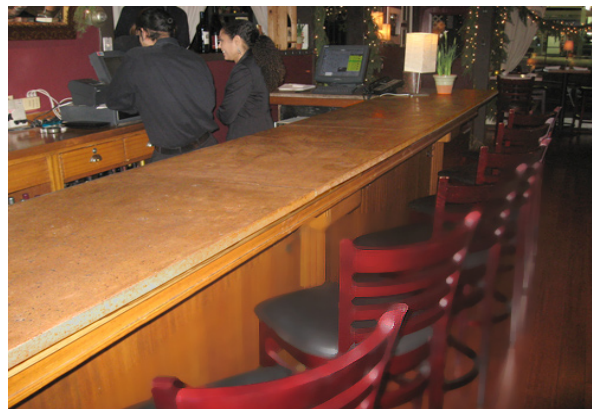
Flea Street Cafe, Menlo Park, CA.

CONTACT INFORMATION: www.bottlestone.com 650.949.0999 info@bottlestone.com